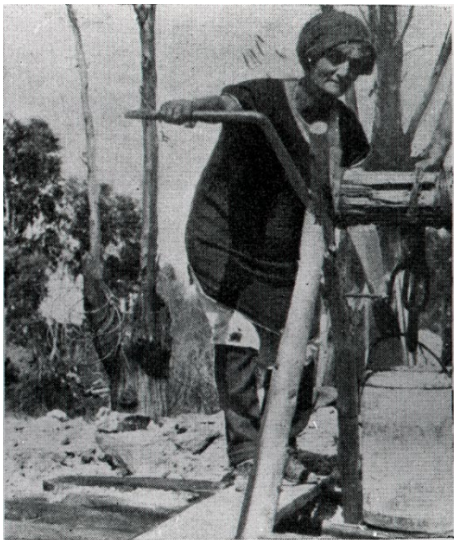
This digger's wife kept the flag flying and the mine going while her husband was on active service.

The 8 th March sees the world celebrating International Women's Day. There have been many strong, determined and amazing women that have helped make the Goldfields a better place to live, raise a family, build a business and survive. Many women did this without recognition but with steely determination. They got on with the business of supporting their men and their children and without our fore mothers beating out new tracks our lives would probably be worse for it.